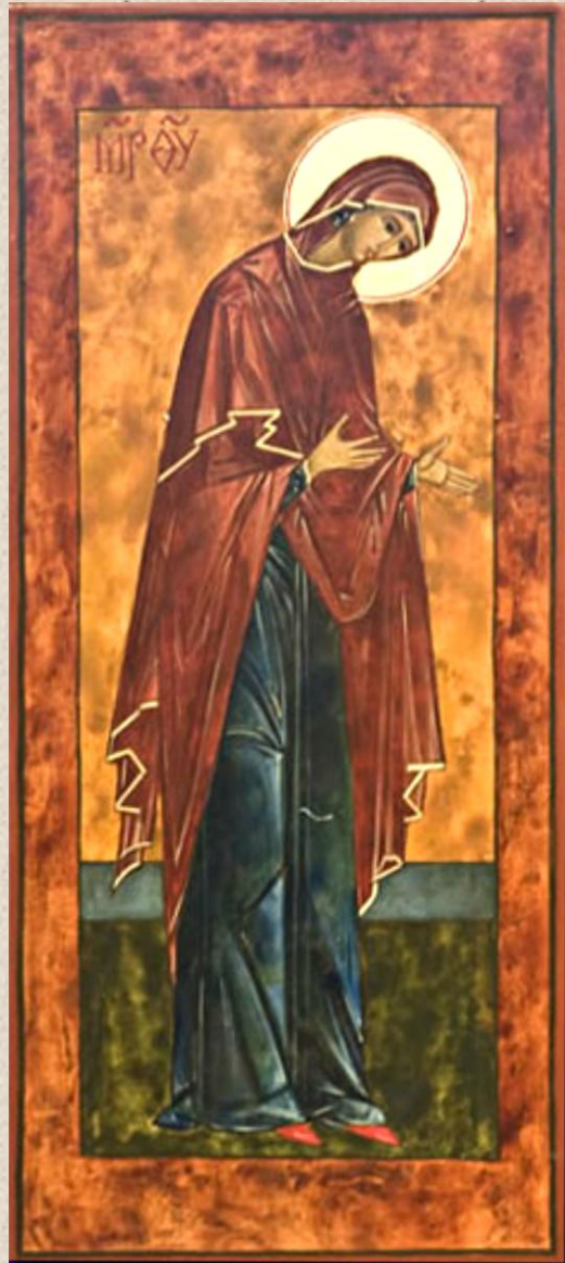
MARY, MOTHER OF GOD (Left)