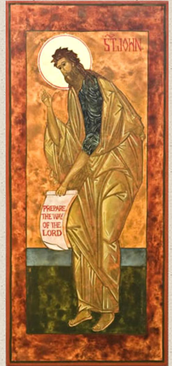
SAINT JOHN THE BAPTIST (Right)